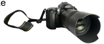
Photo Opportunity Spot: The purpose of the Photo Op Spot is to bring some fun to the event. It is a great location for the photographer to take group photos. These photos can then be put in an album on your Facebook page. Let guests know where they can access the photos. They can then share the image on their page, which is a great way to engage on social media.

Example: Have the photographer set up a photo booth with a white backdrop. Bring an orange carpet and work zone props for the photo booth. You may even want to purchase a customized backdrop with #NWZAW and #Orange4Safety on it.